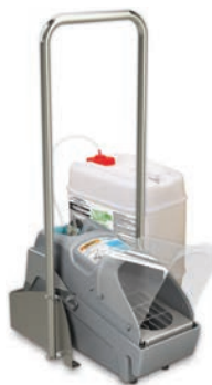
SmartStep Sanitizing Unit w/ Handle