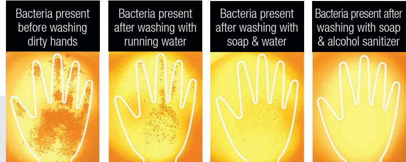
Testing performed by Saraya Biochemical Laboratory

Is hand washing alone “good enough?” In the study below, the effects of hand hygiene on bacteria can be seen.