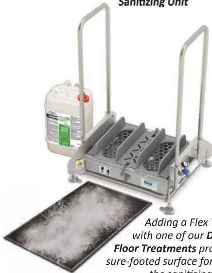
Adding a Flex Tip Mat with one of our Dry Step Floor Treatments provides a sure-footed surface for exiting the sanitizing station - see page 18

The new HACCP SmartStep2™ Walk-Through Dual Footwear Sanitizing Unit is a foot-operated system that requires no electricity, and uses compressed air to deliver an atomized spray of Alpet D2 Surface Sanitizer or Alpet D2 Quat-Free Surface Sanitizer to the bottom of footwear soles. Ideal for operations requiring faster throughput.