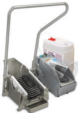
SmartStep Sanitizing Unit w/ Scrubber and Handle